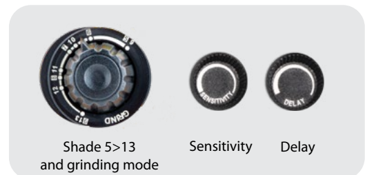
Shade 5>13 and grinding mode